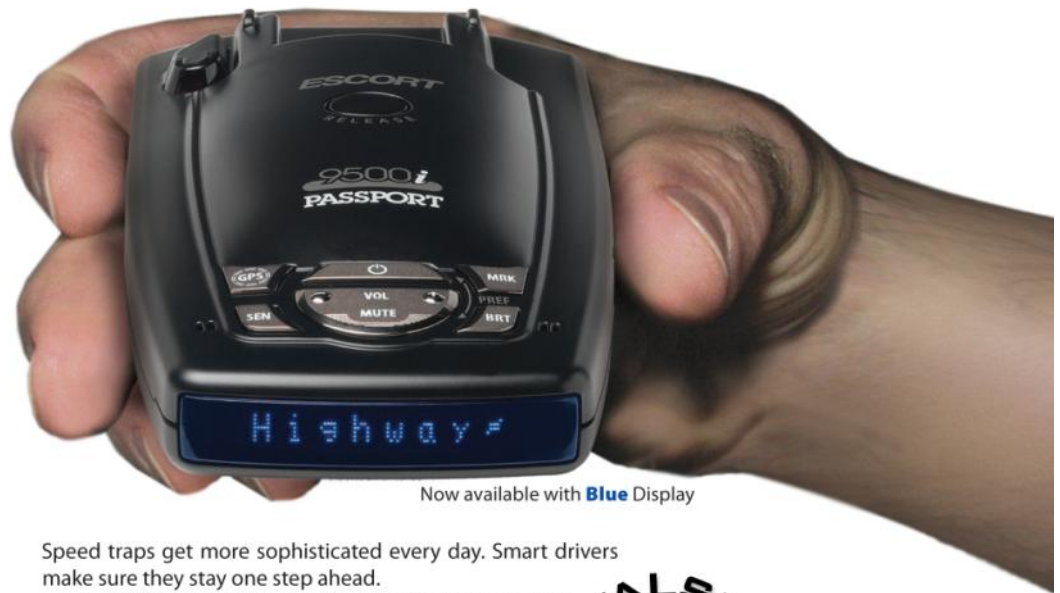
Now available with Blue Display

Limited Time Offer Trade-in your old detector and save!